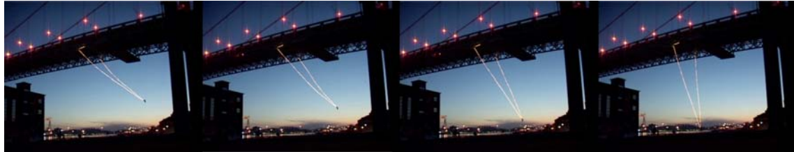
Figure 2. The art experiment in Älvsborgsbron, Gothenburg.

of rhythm. That insight made it important to continue to develop qualitative artistic methods in order to comprehend complex combinations of rhythms between planning and self-organisation inherent in the city itself and in knowledge production. One example of that was one of Sand's art experiments, a forty-two meter high swing mounted on the bridge, Älvsborgsbron, in Gothenburg harbour, Sweden (Figure 2). A dancer on a swing moved slowly between the bridge and the ground, captured in a rhythmic experience of being earthbound and then weightless. The rhythmic procedure of keeping the swing in motion employed the bridge and re-formulated its function by introducing another corporeal process, in the space in-between the bridge and the ground.